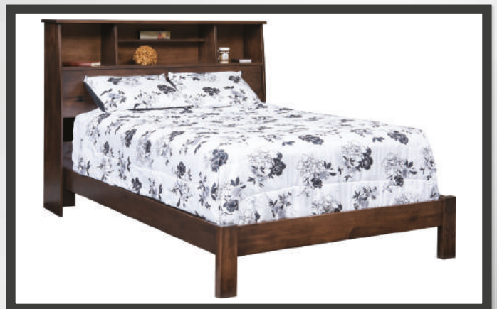
6" RAILS, 15" FOOTBOARD, LOW STANDARD

ALL BOOKCASE HEADBOARDS CAN BE DONE WITH ANY COMBINATION OF FOOTBOARDS AND RAILS