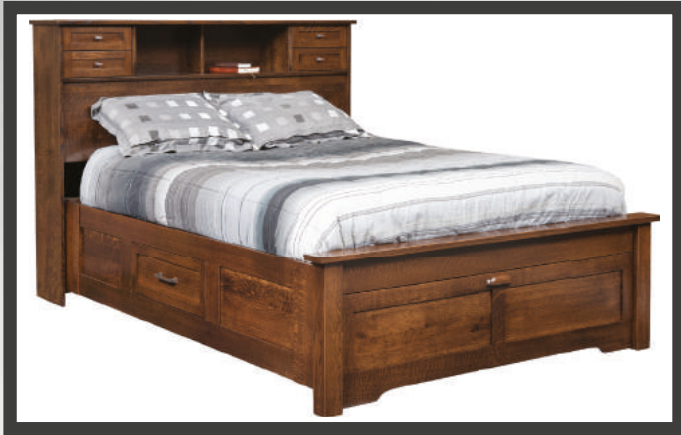
TOPPED PULL OUT FOOTBOARD