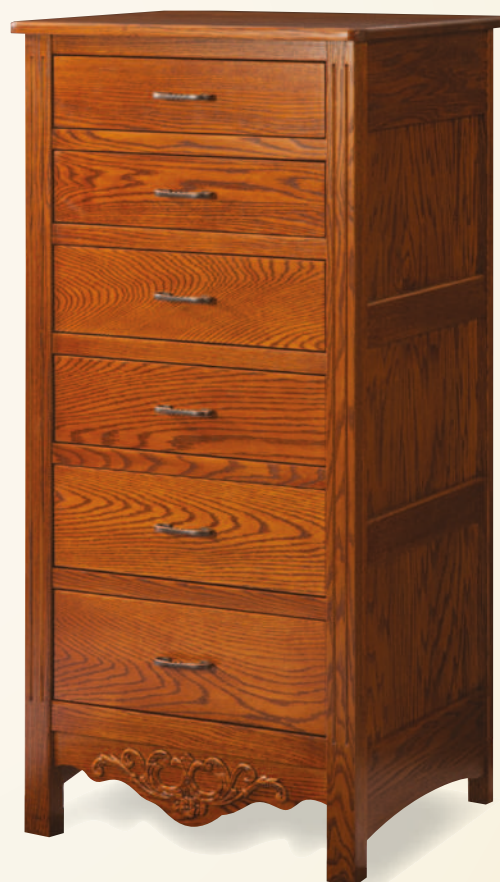
#503-C Chest 24" W x 55" H (carved)

Shown in Red Oak with Michael's Cherry Stain