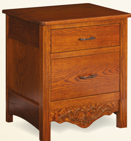
#502-C Nightstand 24½" W x 28" H (carved)