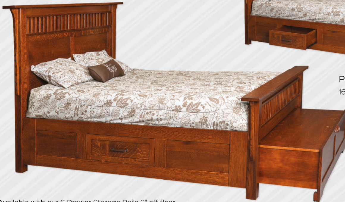
Pullout Bench 16" H x 27" D MAX

Available with our 6 Drawer Storage Rails 3" off floor Six, 7"H x 22"W x 22" D drawers Bottom of mattress to floor is 17"