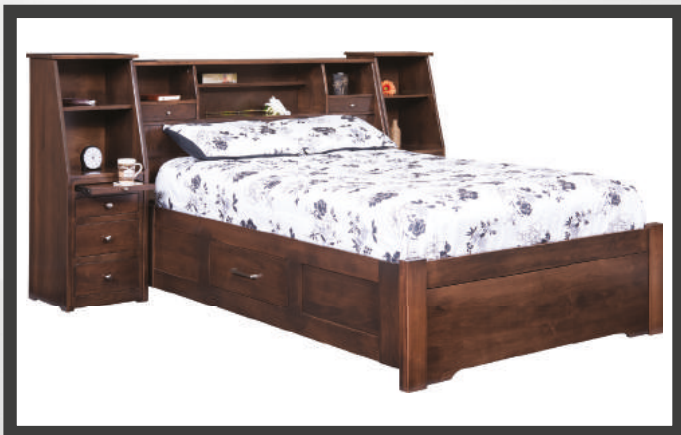
PULL OUT WITH NO TOP AND FLUSH DRAWER FRONT