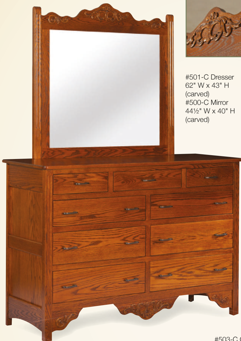
#501-C Dresser 62" W x 43" H (carved) #500-C Mirror 44½" W x 40" H (carved)