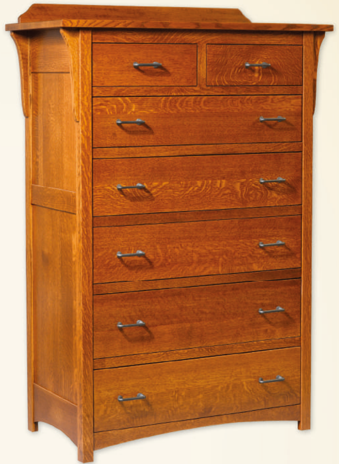
#105 Chest 38" W x 61" H

Shown in Quarter Sawn White Oak with Michael's Cherry Stain