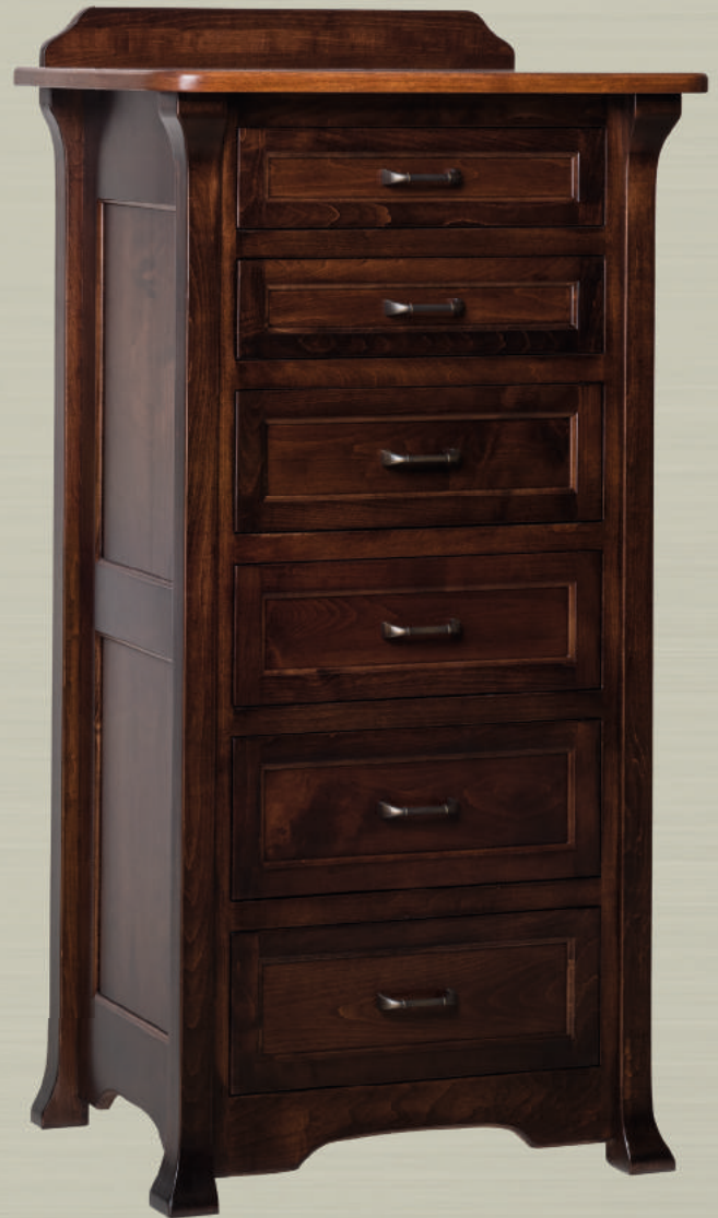
#3103 29" Chest

55" H Top 1" x 21½" x 31" Rounded Ends and Front 3½" Overhang Center Front