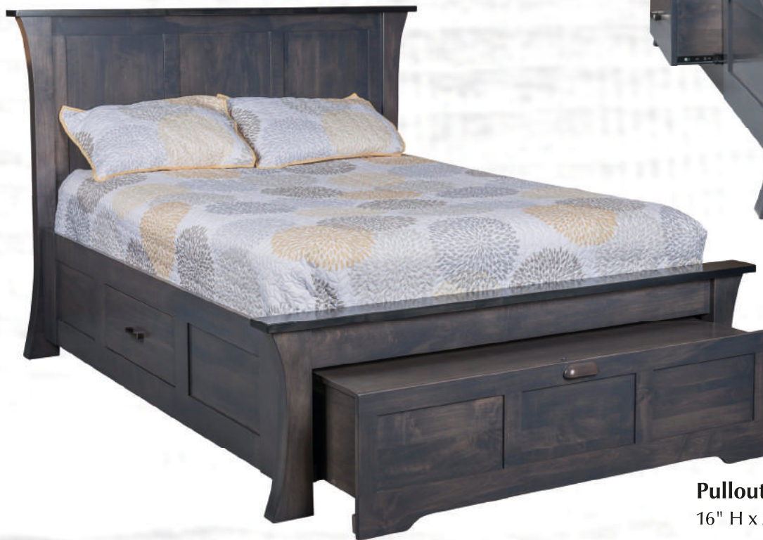
Pullout Bench 16" H x 27" D MAX

Available with our 6 Drawer Storage Rails 3" off floor 6 drawers: 7½" H x 22" W x 22" D Bottom of mattress to floor is 17"