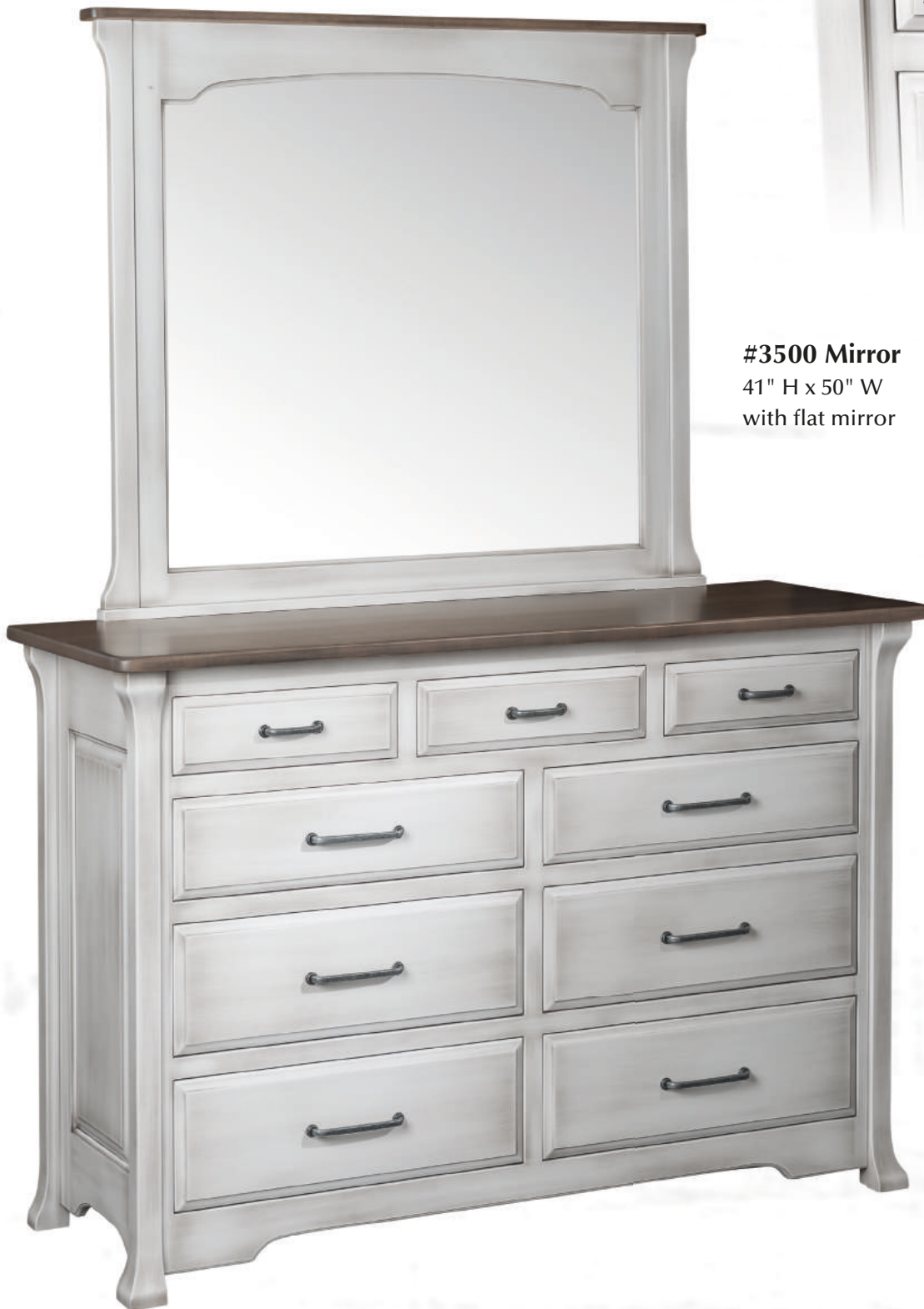
#3500 Mirror 41" H x 50" W with flat mirror