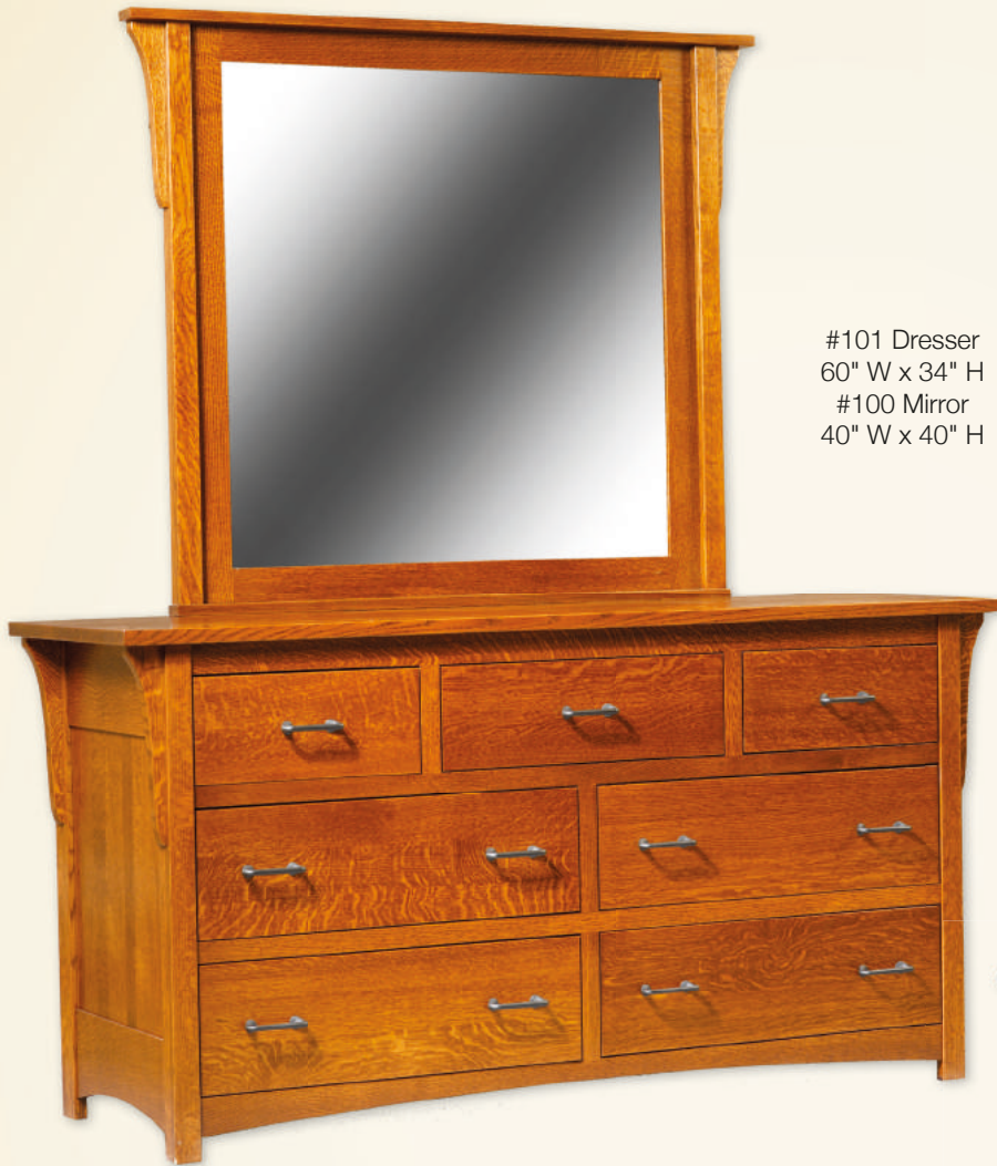
#101 Dresser 60" W x 34" H #100 Mirror 40" W x 40" H

Shown in Quarter Sawn White Oak with Michael's Cherry Stain