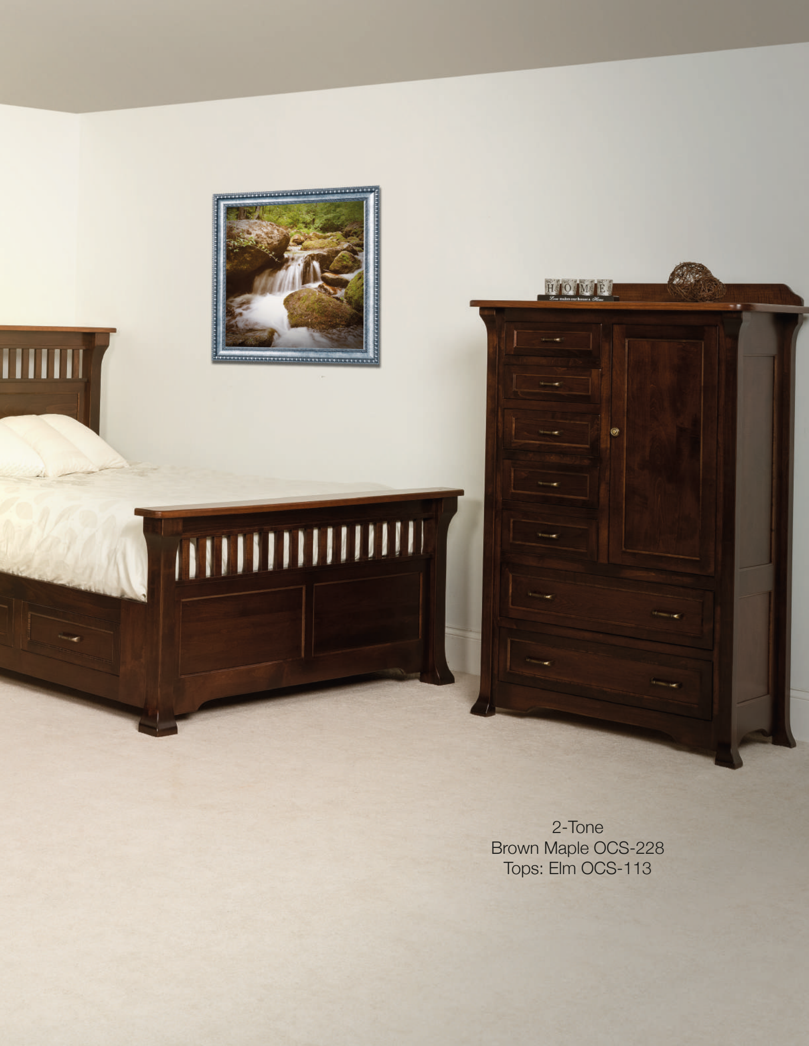
2-Tone Brown Maple OCS-228 Tops: Elm OCS-113