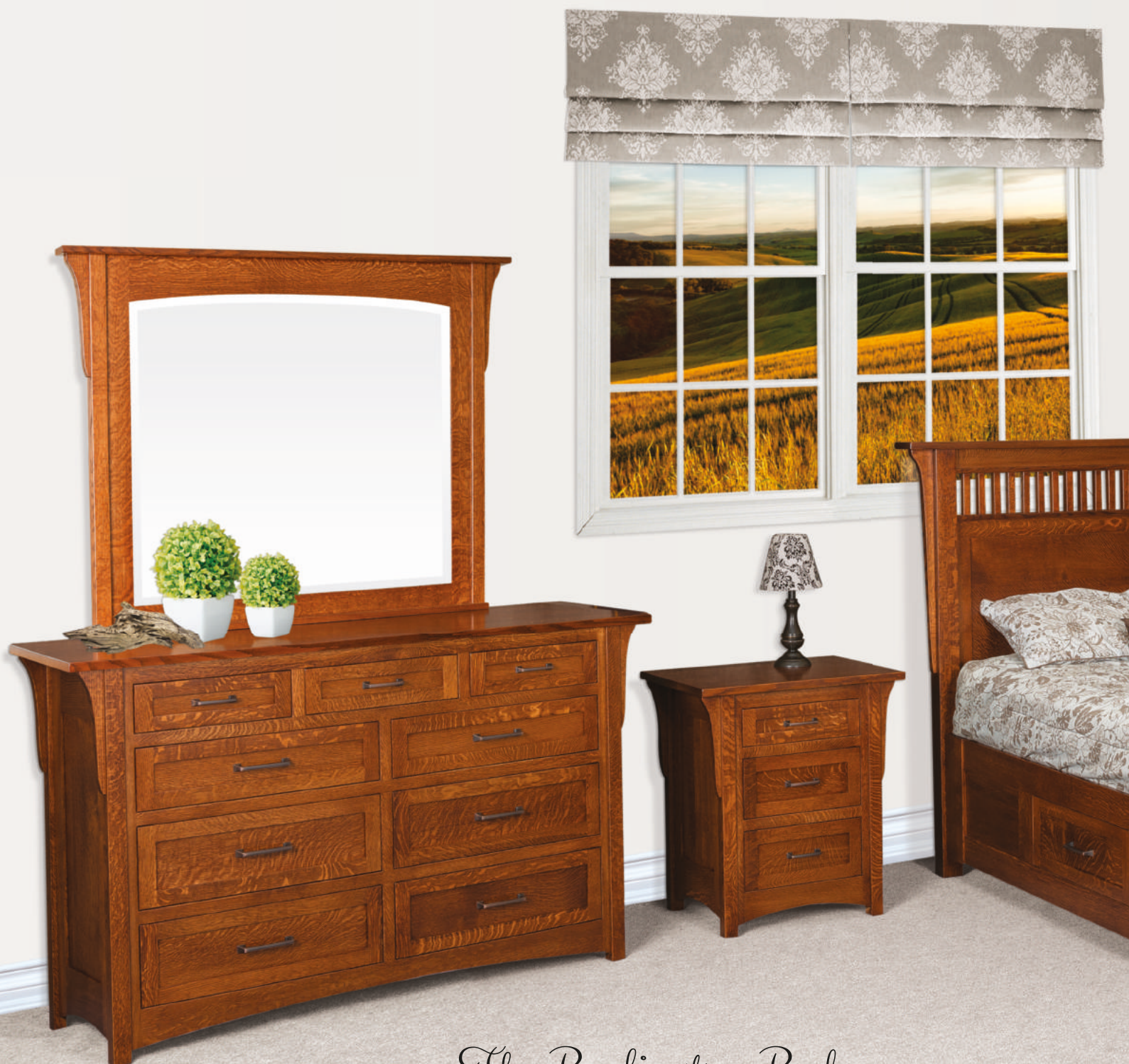
The Burlington Bedroom... built to last a lifetime, designed for an impressive look.