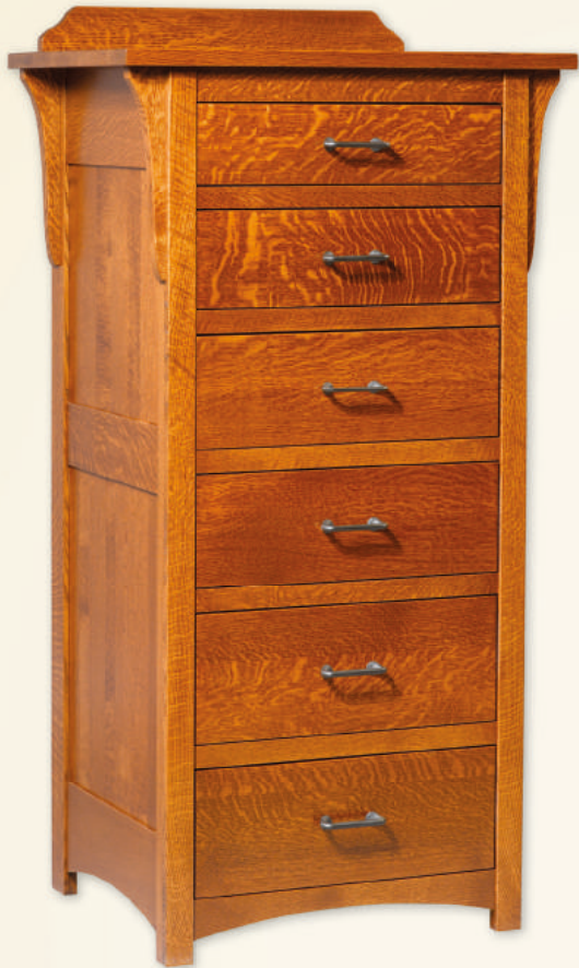
#103 Chest 24" W x 54" H