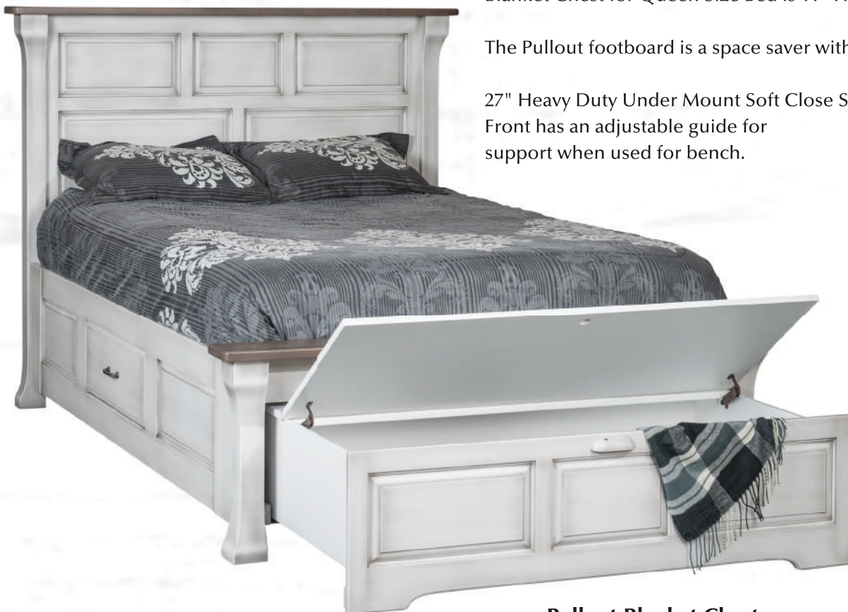
Pullout Blanket Chest

27" Heavy Duty Under Mount Soft Close Slide. Front has an adjustable guide for support when used for bench.