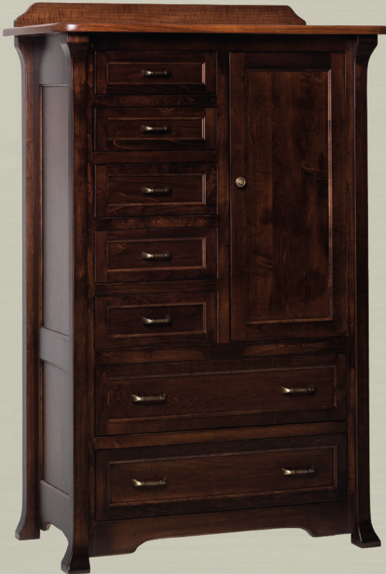
#3104 40" Chest w/Side Door

Side Door has 2 Adjustable Shelves 16" Deep Drawers