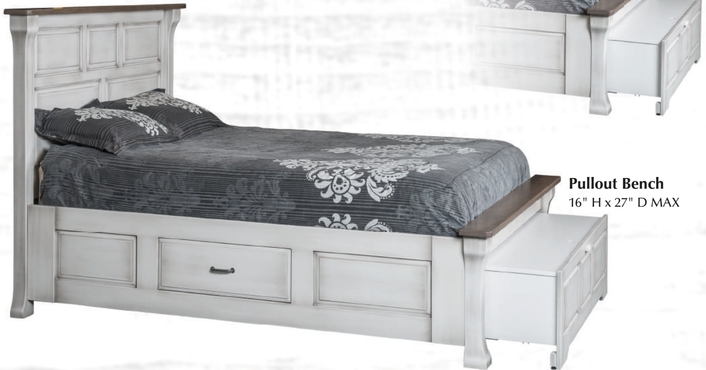
Pullout Bench 16" H x 27" D MAX

Available with our 6 Drawer Storage Rails 3" off floor 6 drawers: 7½" H x 22" W x 22" D Bottom of mattress to floor is 17"