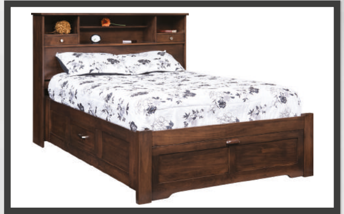
PULL OUT FOOTBOARD NO TOP