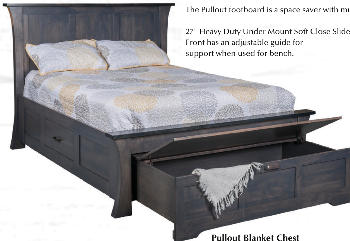
Pullout Blanket Chest

27" Heavy Duty Under Mount Soft Close Slide. Front has an adjustable guide for support when used for bench.