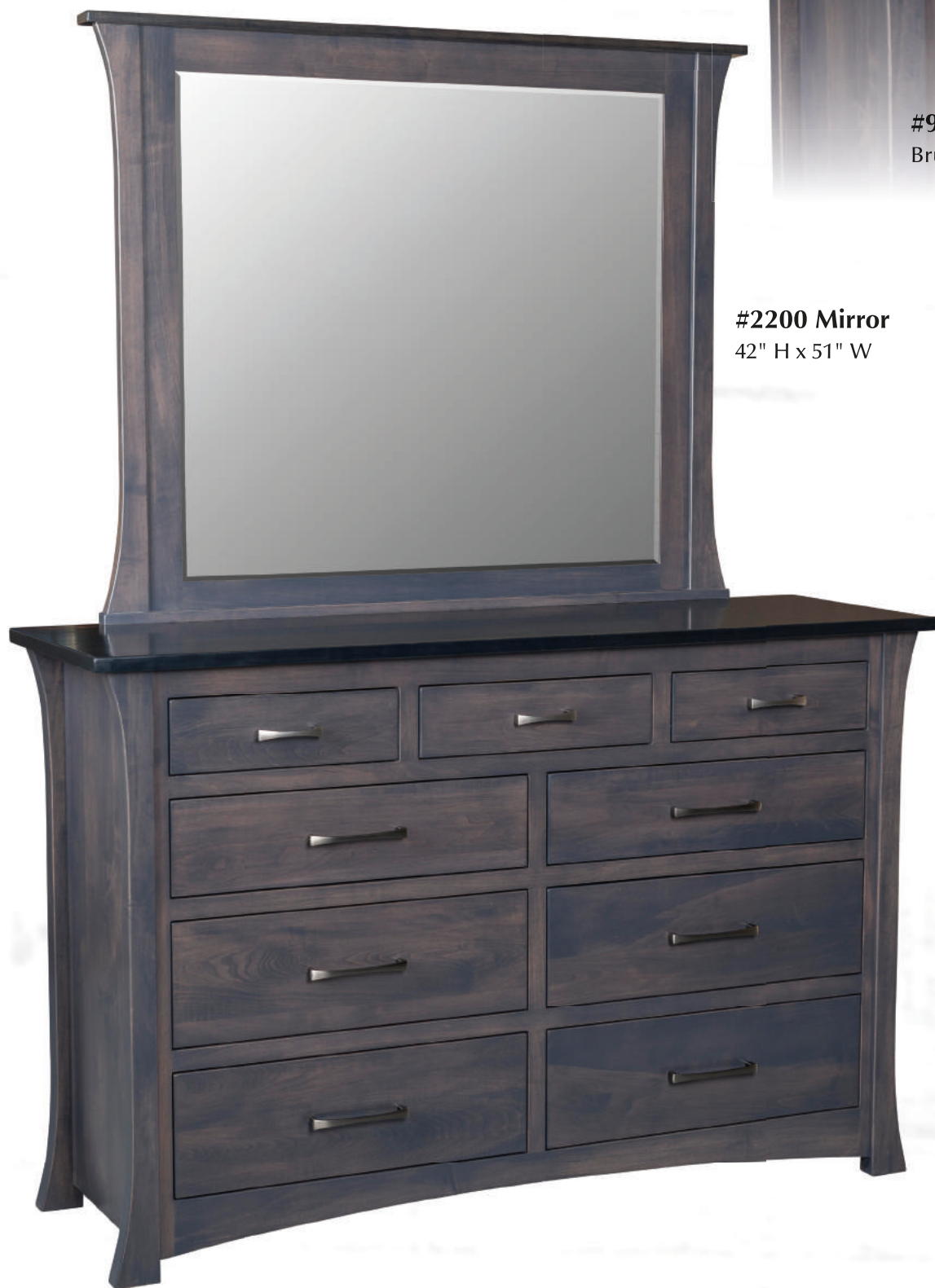
#9232 Hardware Brushed Tin