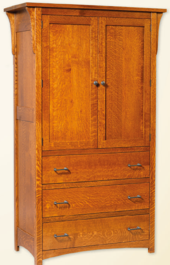
#104 Armoire 38" W x 72" H

Shown in Quarter Sawn White Oak with Michael's Cherry Stain