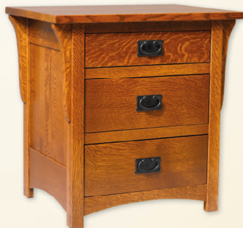
#102 shown with optional Mission Hardware