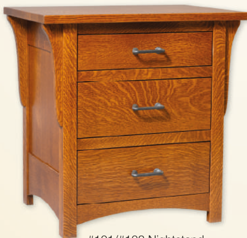
#101/#102 Nightstand 22" W x 28" H Top 28" W

Note: Same specie and stain as Geneva Bed on page 3. (This picture shows lighter)