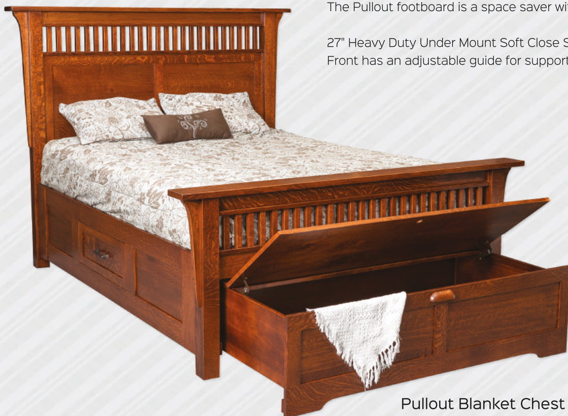
Pullout Blanket Chest

27" Heavy Duty Under Mount Soft Close Slide. Front has an adjustable guide for support when used for bench.