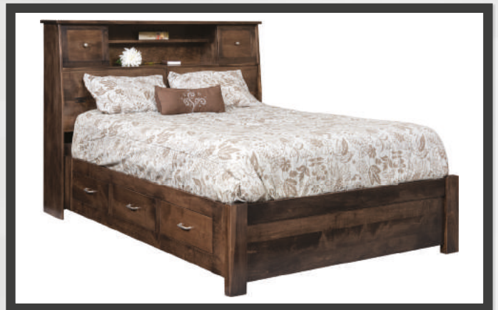
18" FOOTBOARD WITH 6 DRAWER STORAGE