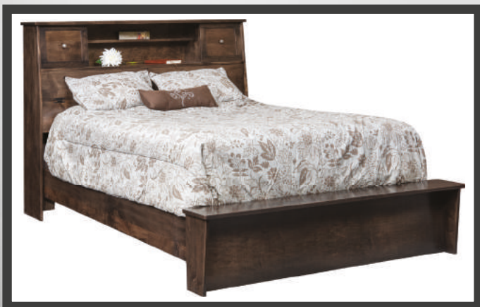
16" BENCH FOOTBOARD, 9" WIDE TOP FOR SEAT