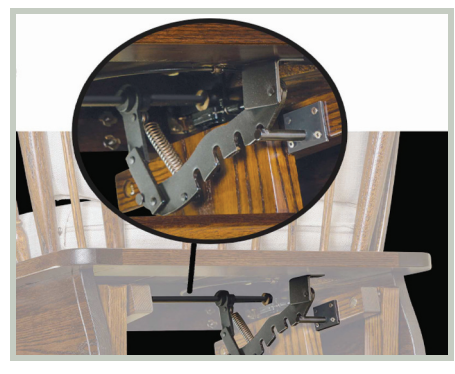
Locking System Has 4 positions from recline to upright