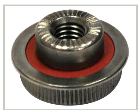
Bearings Have a load rating of 200 lbs. each and come with an 8-year warranty