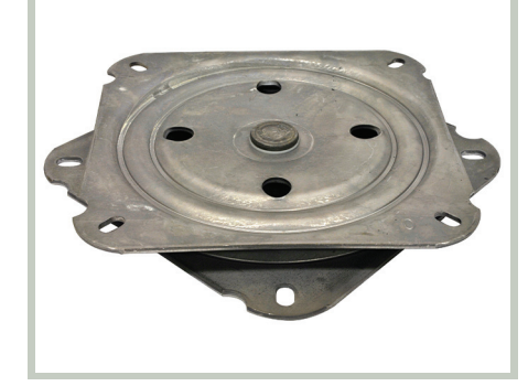
Heavy-duty Swivel Mechanisms Lifetime Warranty