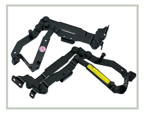
A Lifetime Warranty Comes with all our flip-out hardware