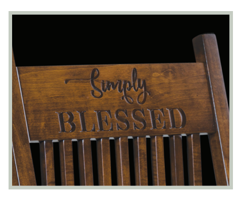
Headrest Engraving Adds a personalized touch (available on Royal Mission