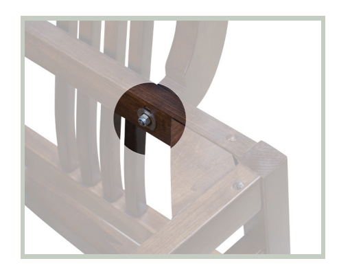
Bolted-on arm attachments Add even more stability