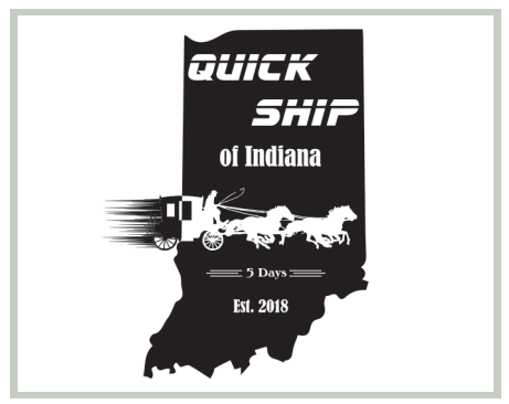
D&E Quick Ship Offers 7 different styles for quick turnaround