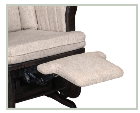
Flip-out Footrest Is an exclusive D&E design