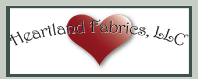
Standard & Premium