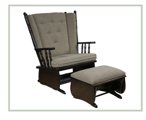
Chair-N-Half Glider Are 7" wider than standard