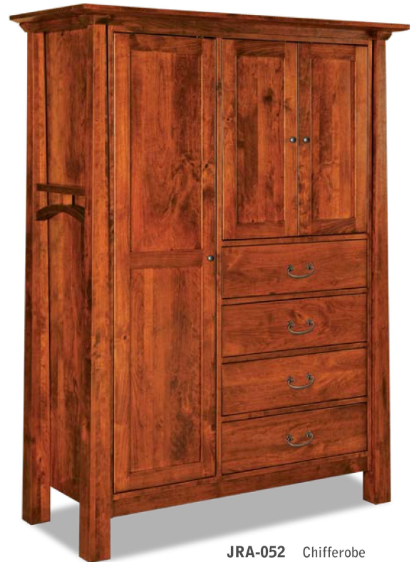
JRA-052 Chifferobe 4 Dw., 3 Dr., 4 Shelves, 1 Adj. Rod 55 1/4w 24 1/4d 71 3/4h Dbl. dr. op. 25 3/4w 18 1/2d 28h