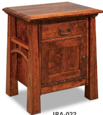
JRA-022 1 Dw., 1 Dr. Nightstand 25w 18 1/2d 28 3/4h