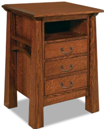
JRA-029 3 Dw. Nightstand 25w 18 1/2d 32 1/4h