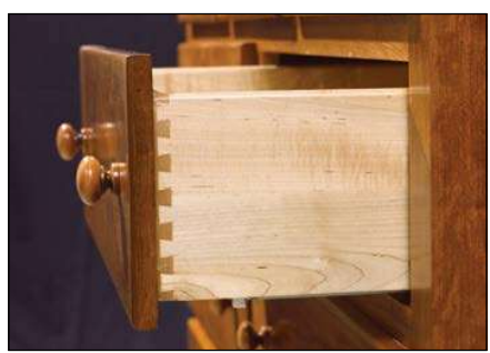
Optional Blum under-mount concealed slides with soft close (upcharge)