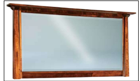
JRA-031 Bev. Mirror 60w 3d 32½h