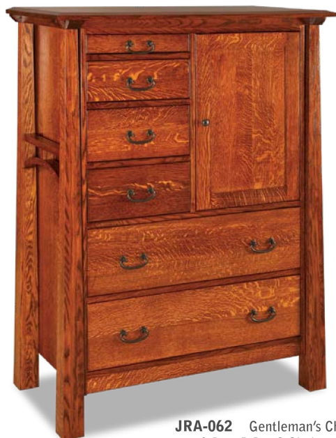
JRA-062 Gentleman's Chest 6 Dw., 1 Dr., 2 Shelves 43w 23d 56 \frac{3}{4} h