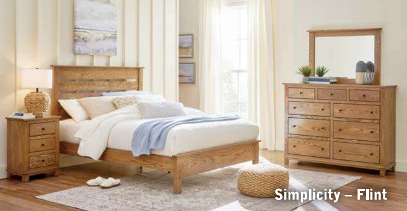
Simplicity – Flint