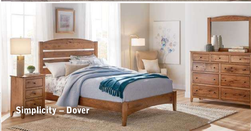
Simplicity - Dover