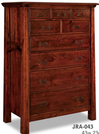
JRA-043 9 Dw. Chest 43w 23d 58½h