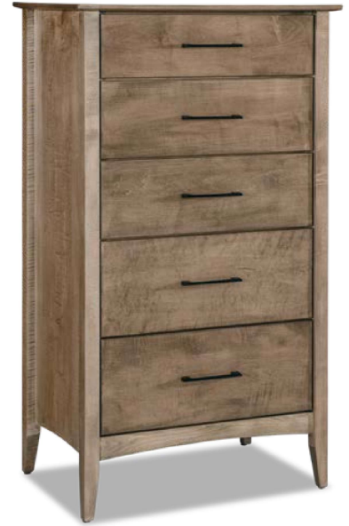
JRAL-035 5 Dw. Chest 32½w 22½d 57¾h Br. Maple • Sandstone