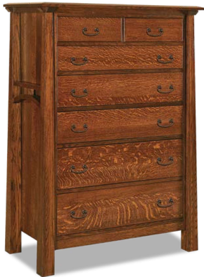
JRA-042 7 Dw. Chest 43w 23d 60h