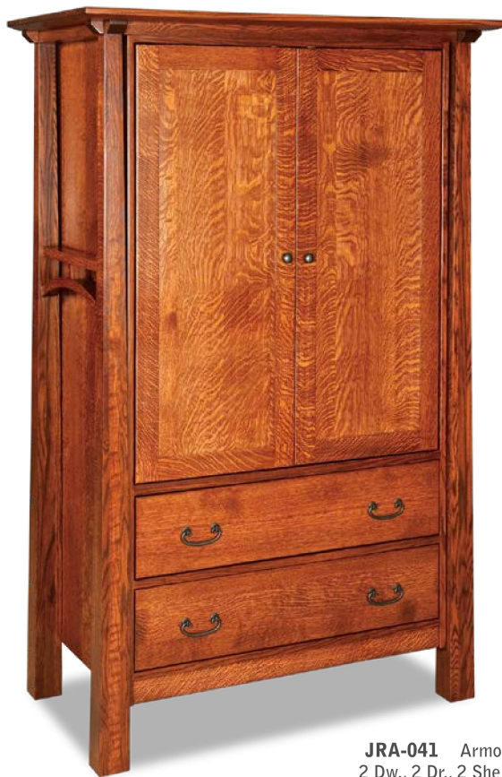
JRA-041 Armoire 2 Dw., 2 Dr., 2 Shelves 46w 25 3 / 4 d 71 3 / 4 h Dbl. dr. op. 33 1 / 2 w 20 1 / 2 d 42h