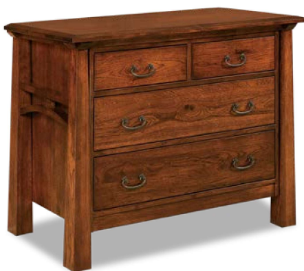
JRA-032 4 Dw. Chest 43w 23d 34 \frac{3}{4} h