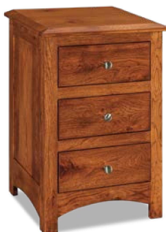
Finland (Brown Maple or Oak)