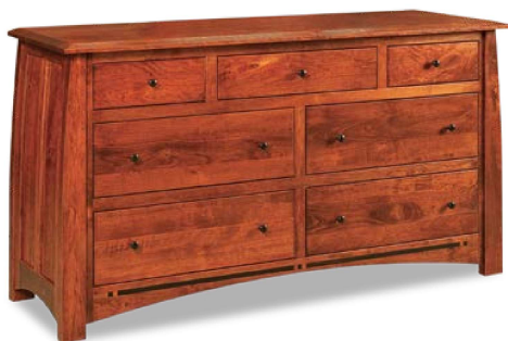
JRBC-068 7 Dw. Dresser 67w 22 1 / 2 d 36 3 / 4 h