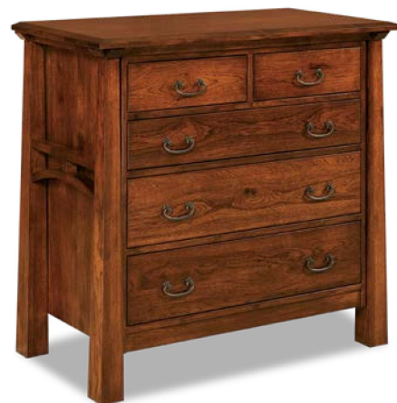
JRA-032-1 5 Dw. Chest 43w 23d 41 \frac{1}{4} h