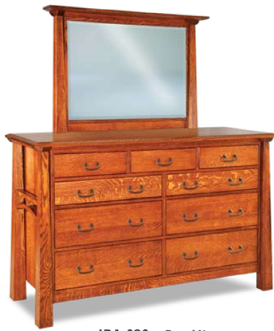
JRA-030 Bev. Mirror 44w 3d 32½h