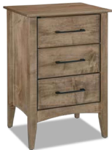
JRAL-021 3 Dr. Nightstand 21½w 17¼d 32¼h Br. Maple • Sandstone