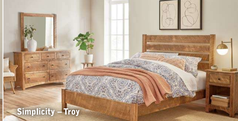
Simplicity – Troy