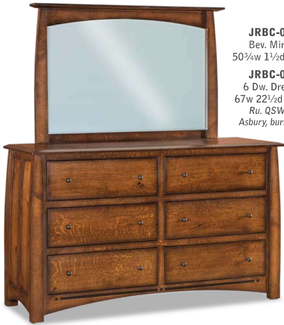
JRBC-045 Bev. Mirror 50 3 / 4 w 1 1 / 2 d 34 1 / 4 h