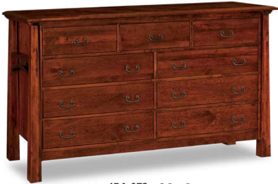
JRA-073 9 Dw. Dresser 75½w 23d 43h