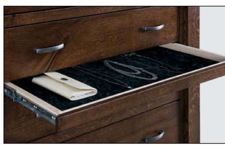
Pop-out rail secret compartment (1 1/2" depth); N/A on Artesa, Atlantic, Chippewa Sleigh, Heritage, Cascade, Old Classic Sleigh, Sequoyah, or Shaker collections