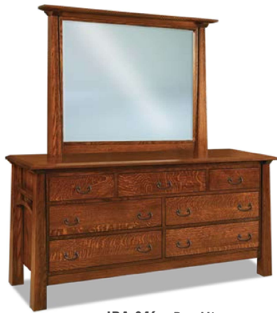
JRA-046 Bev. Mirror 47½w 3d 38¼h