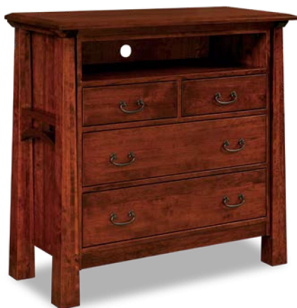
JRA-032-2 4 Dw. Media Chest 43w 18 \frac{1}{2} d 41 \frac{1}{4} h