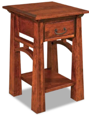
JRA-019 1 Dw. Nightstand 19 1/2w 18 3/4d 28 3/4h