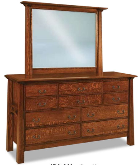
JRA-046 Bev. Mirror 47½w 3d 38¼h