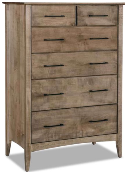
JRAL-040 6 Dw. Chest 40w 22½d 57¾h Br. Maple • Sandstone