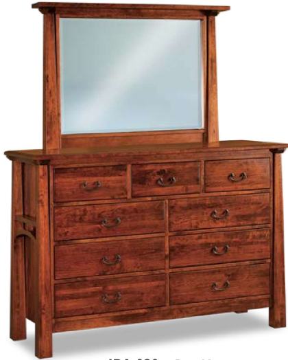
JRA-030 Bev. Mirror 44w 3d 32½h