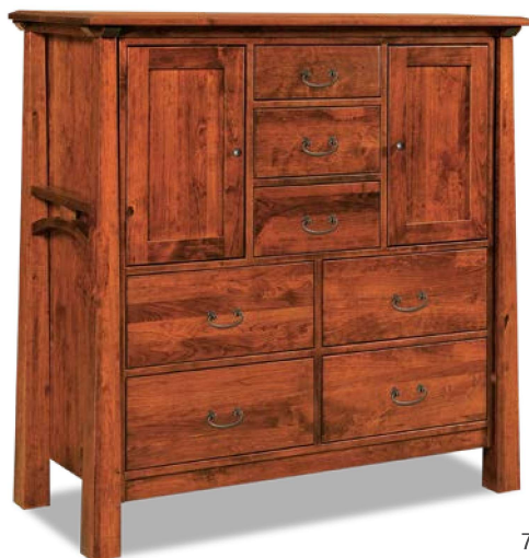
JRA-051 His & Hers Chest 7 Dw., 2 Dr., 4 Shelves 53 \frac{1}{4} w 23d 53 \frac{1}{2} h