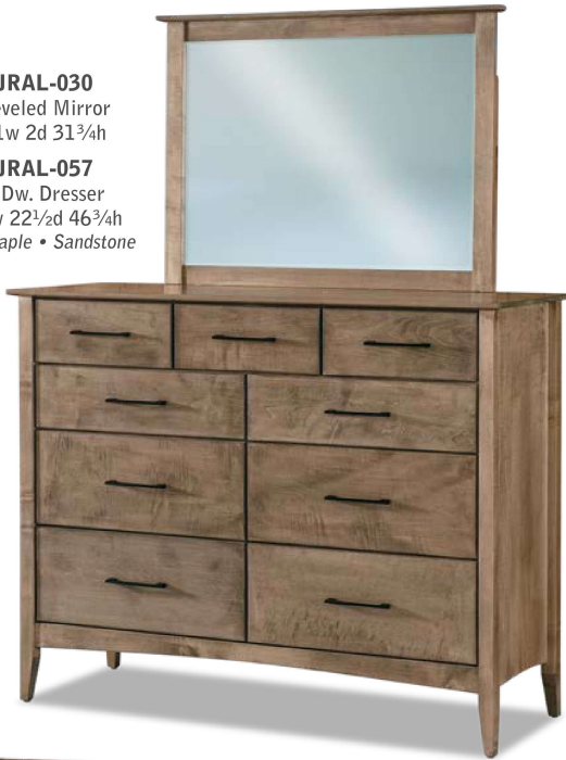
JRAL-057 9 Dw. Dresser 59w 22½d 46¾h Br. Maple • Sandstone