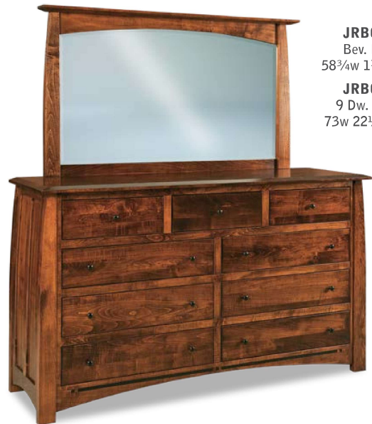
JRBC-031 Bev. Mirror 58 3 / 4 w 1 1 / 2 d 34 1 / 4 h