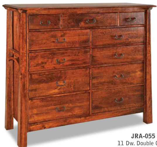
JRA-055 11 Dw. Double Chest 62 \frac{1}{4} w 23d 53 \frac{1}{2} h