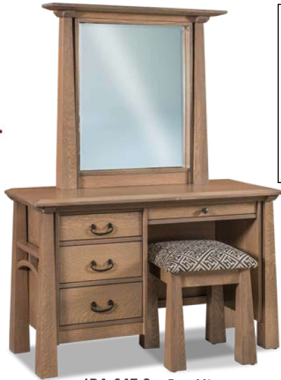
JRA-047-2 Bev. Mirror 29¾w 3d 33¼h