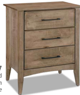
JRAL-027 3 Dr. Nightstand 26½w 17¼d 32¼h Br. Maple • Sandstone