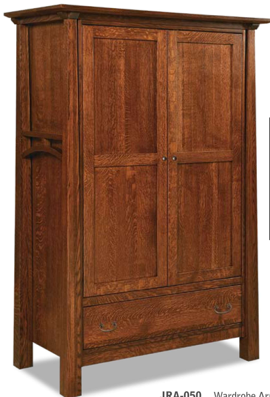
JRA-050 Wardrobe Armoire 1 Dw., 2 Dr., 1 Adj. Rod & Shelf 50w 25 3 / 4 d 71 3 / 4 h I.D.: 37 1 / 2 w 21d 52 1 / 2 h