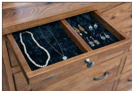
Jewelry drawer - left 7 9/16"w x 13 7/8"d x 1 1/8"h Jewelry drawer - right 5 1/2"w x 13 7/8"d x 1 1/8"h