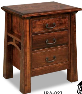
JRA-021 3 Dw. Nightstand 25w 18 1/2d 28 3/4h