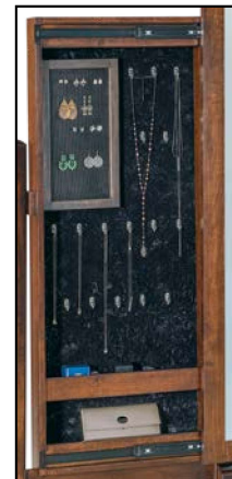
JRA-056 Bev. Jewelry Mirror 27w 18½d 66¼h