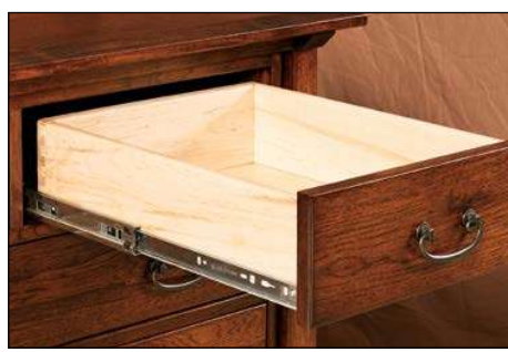
Standard full extension slides and 5/8" dovetailed drawer boxes on all styles

exhibits the natural beauty of oak, cherry, maple, hickory, brown maple and distinctive quarter-sawn white oak the bedroom furniture you select will grace your home for generations to come. Designed and built with integrity, combining traditional methods and modern manufacturing processes we feel confident that you will cherish your selections from our many furniture styles.