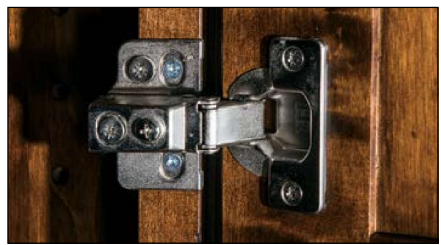
Standard soft close hinge on all doors