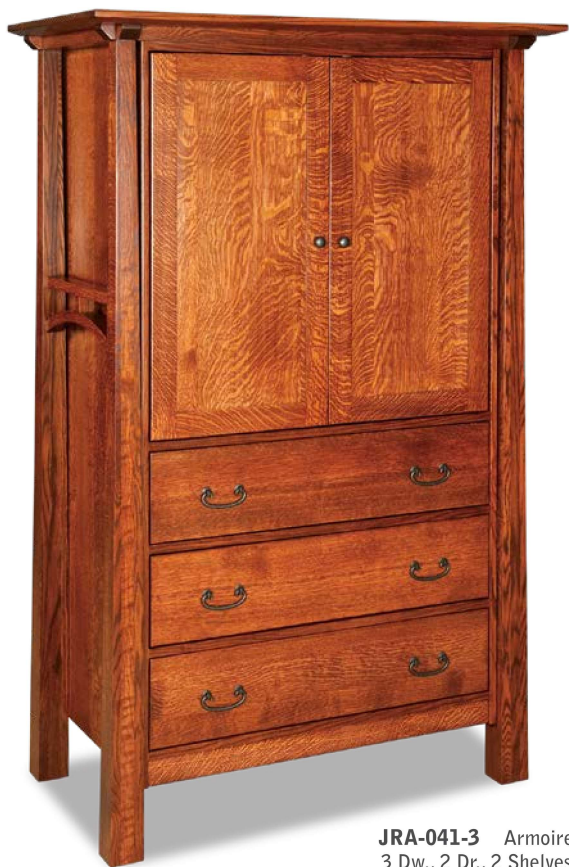
JRA-041-3 Armoire 3 Dw., 2 Dr., 2 Shelves 46w 25 3 / 4 d 71 3 / 4 h Dbl. dr. op. 33 1 / 2 w 20 1 / 2 d 33 1 / 4 h