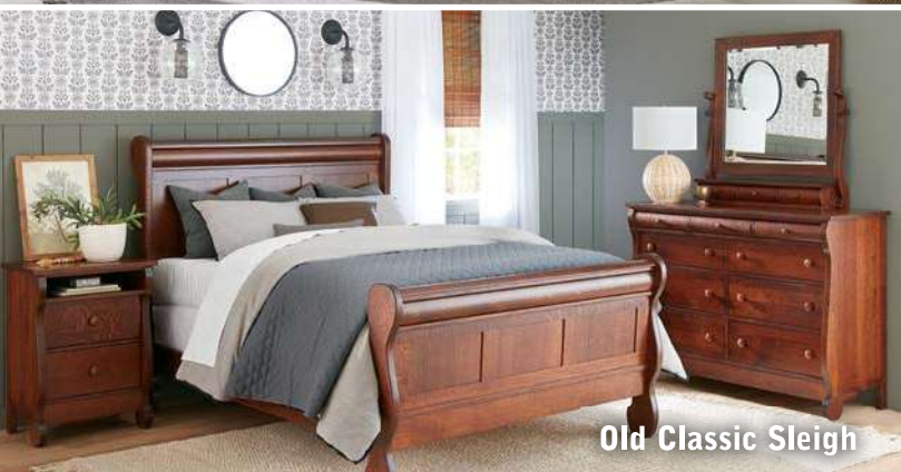
Old Classic Sleigh