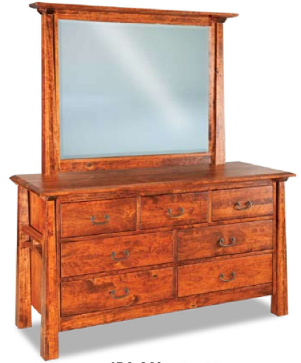
JRA-046 Bev. Mirror 47½w 3d 38¼h