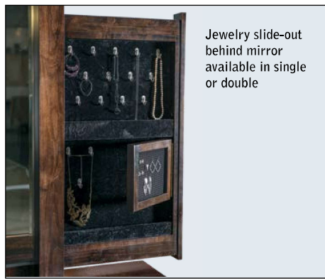
Jewelry slide-out behind mirror available in single or double