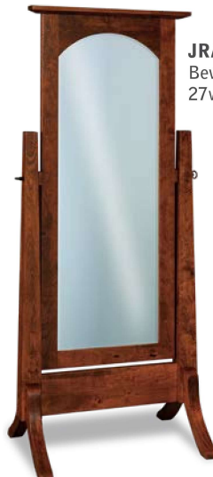
JRA-056-3 Bev. Cheval Mirror 27w 18½d 66¼h