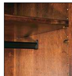
all rods are adjustable