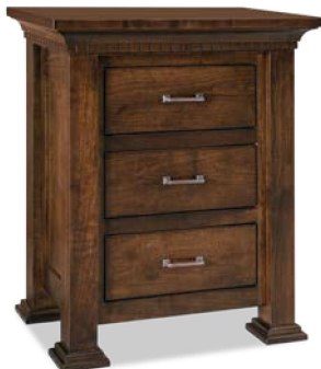
Empire (Brown Maple or Oak)