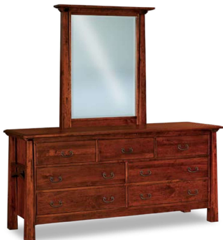
JRA-030-1 Bev. Mirror 34w 3d 42½h