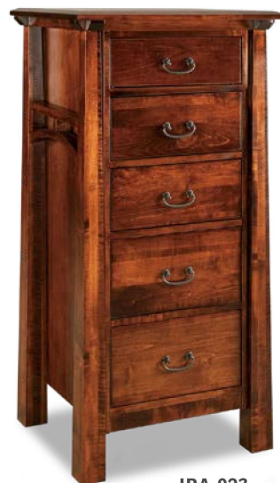
JRA-023 5 Dw. Lingerie Chest 26 \frac{5}{8} w 23d 53 \frac{1}{2} h