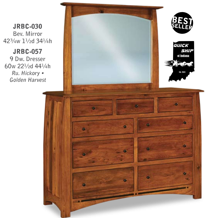
JRBC-030 Bev. Mirror 42 3 / 4 w 1 1 / 2 d 34 1 / 4 h