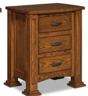
Lexington (Brown Maple)