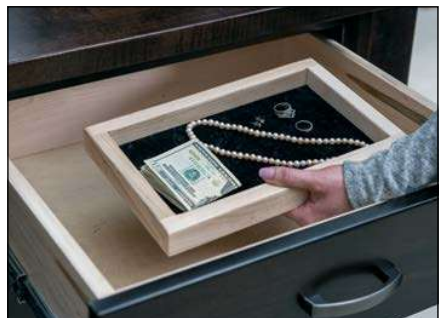
Hidden drawer compartment – a secret place for your valuables 5 7/8"w x 9 7/8"d x 1"h