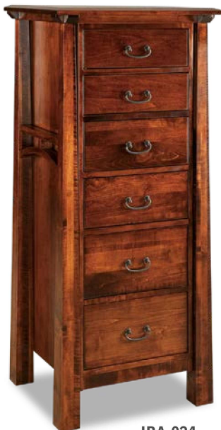
JRA-024 6 Dw. Lingerie Chest 26 \frac{5}{8} w 23d 60h