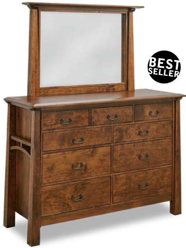
JRA-030 Bev. Mirror 44w 3d 32½h