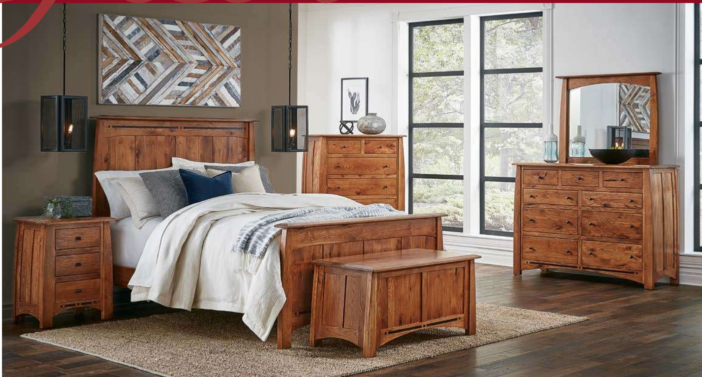
ITBC-057 Boulder Creek Bed , queen size shown in Rustic Hickory with FC809 - Golden Harvest stain headboard 59" tall; footboard 31" tall

Available in oak, maple, brown maple, cherry, gray elm, hickory, quarter sawn white oak, sap cherry, rustic cherry, rustic hickory, rustic plain sawn white oak, and rustic quarter sawn white oak.