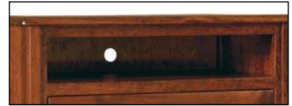
JRA-040-2 4 Dw. Media Chest open media space replaces top 2 drawers of JRA-040 43½w 23d 53½h