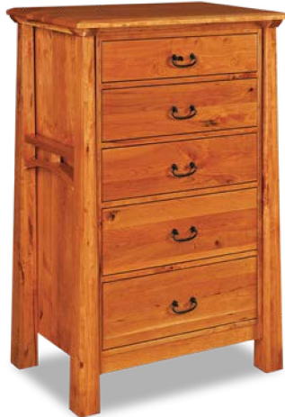
JRA-035 5 Dw. Chest 35½w 23d 53½h