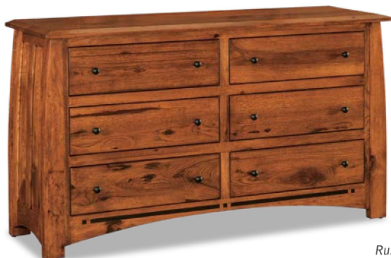
JRBC-059-1-4 6 Dw. Dresser 60w 18d 34 1 / 4 h Ru. Hickory • Golden Harvest