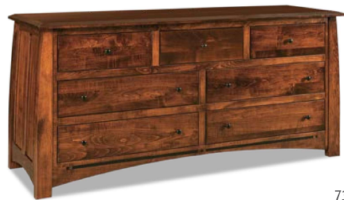
JRBC-072 7 Dw. Dresser 73w 22 1 / 2 d 34 1 / 4 h