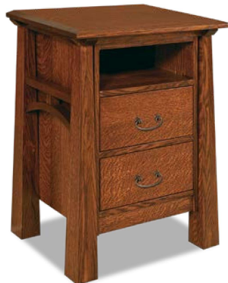
JRA-029-2 2 Dw. Nightstand 25w 18 1/2d 32 1/4h