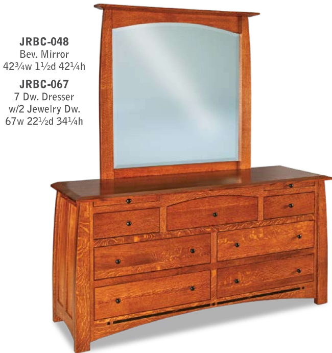
JRBC-048 Bev. Mirror 42 3 / 4 w 1 1 / 2 d 42 1 / 4 h