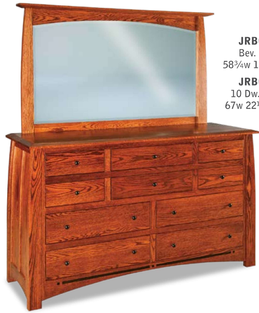
JRBC-031 Bev. Mirror 58 3 / 4 w 1 1 / 2 d 34 1 / 4 h