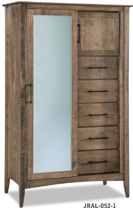
JRAL-052-1 Sliding Door Chifferobe 5 Dw., 2 Dr., 3 Shelves, 1 Adj. Rod 44w 22½d 73½h Br. Maple • Sandstone