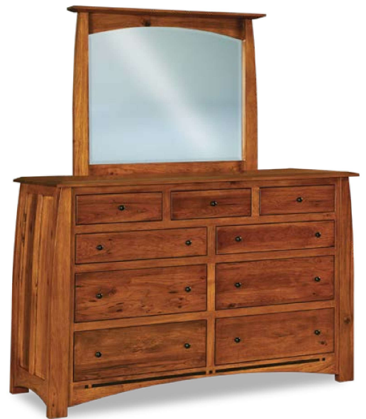
JRBC-030 Bev. Mirror 42 3 / 4 w 1 1 / 2 d 34 1 / 4 h