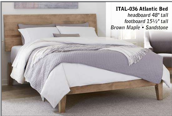
ITAL-036 Atlantic Bed headboard 48" tall footboard 15½" tall Brown Maple • Sandstone