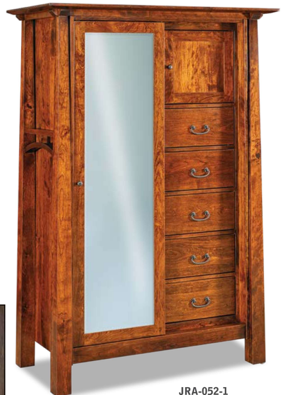
JRA-052-1 Sliding Door Chifferobe 5 Dw., 2 Dr., 3 Shelves, 1 Adj. Rod 49w 24 1/4d 73h Ru. Cherry • Michael's Cherry