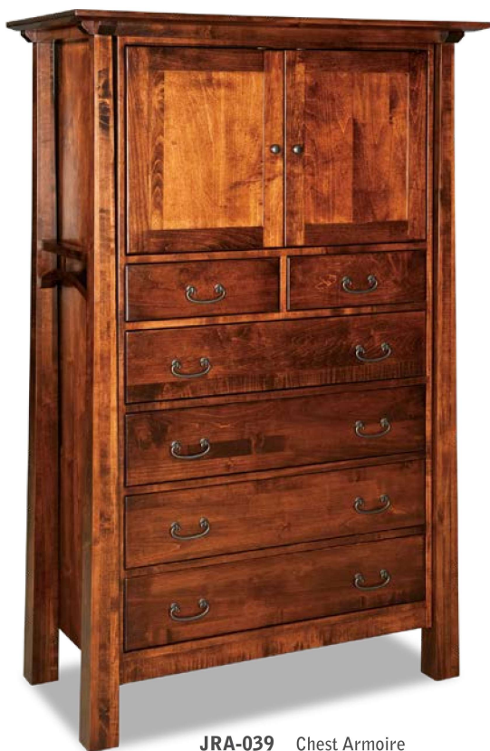
JRA-039 Chest Armoire 6 Dw., 2 Dr., 1 Shelf 46w 24 1 / 4 d 71 3 / 4 h Dbl. dr. op. 33 1 / 2 w 18 1 / 2 d 20 3 / 4 h