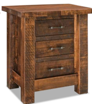
Houston (Rustic Rough Sawn Brown Maple)