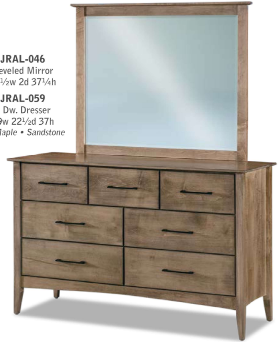
JRAL-059 7 Dw. Dresser 59w 22½d 37h Br. Maple • Sandstone