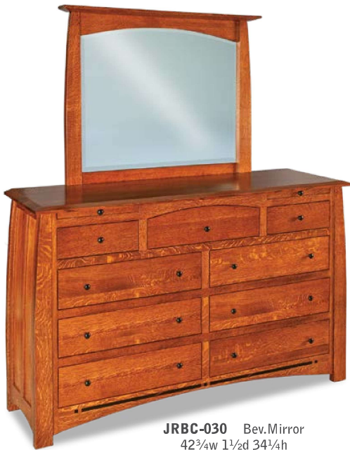
JRBC-030 Bev.Mirror 42 3 / 4 w 1 1 / 2 d 34 1 / 4 h