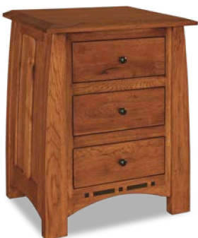
Boulder Creek (Rustic Hickory or Oak)